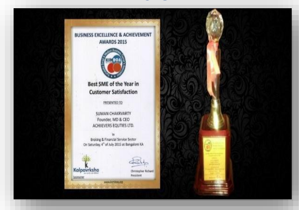
Best SME of the Year, 2015