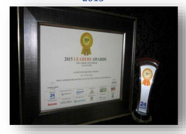
Most Admired Brand for Financial Solutions in West Bengal, 2015