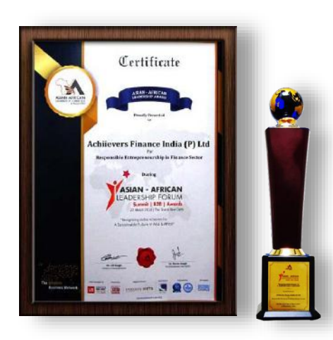
Achiievers Finance India (P) Ltd has been awarded for "Responsible Entrepreneurship in Finance Sector" by Asian-African Chamber Of Commerce & Industry.