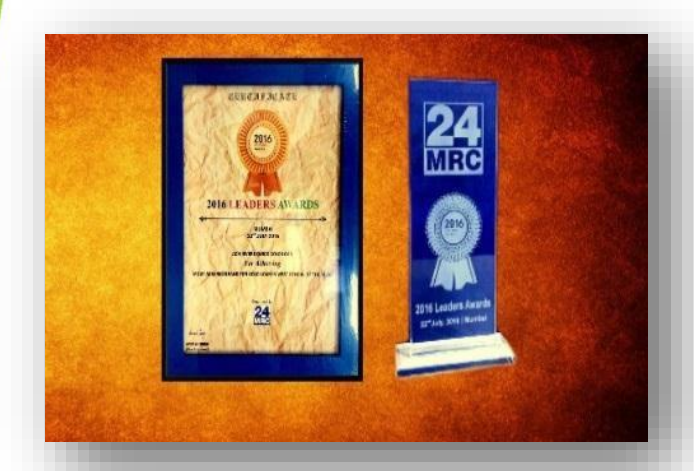
Most Admired Brand for Gold Loan in West Bengal, 2016