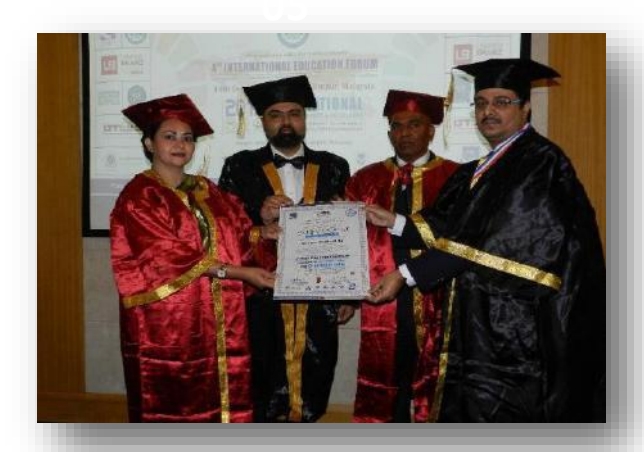
Doctor Of Philosophy In Management (HONORIS CAUSA) 2017