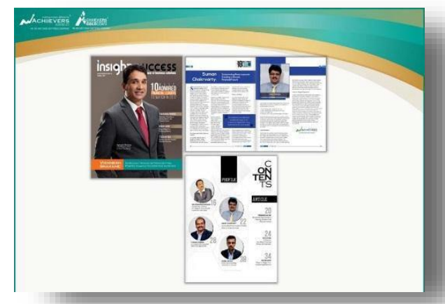
The 10 Most Admired Financial Leaders to Watch in 2017