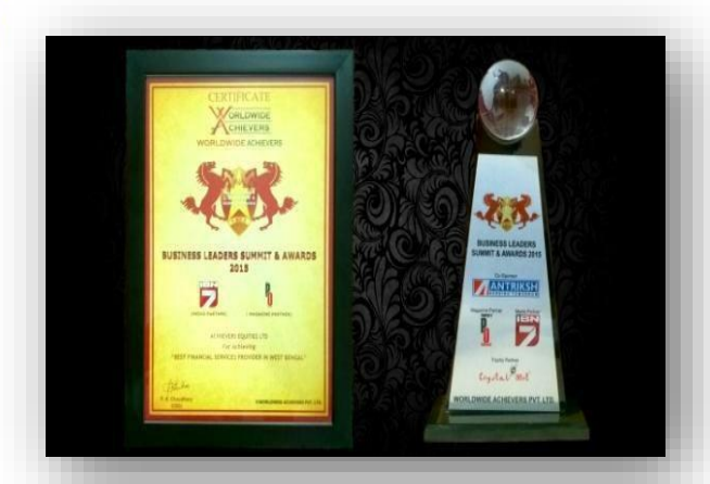
Best Financial Service Provider, 2015