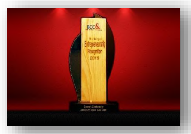
The Bengal Entrepreneurship Award, 2015