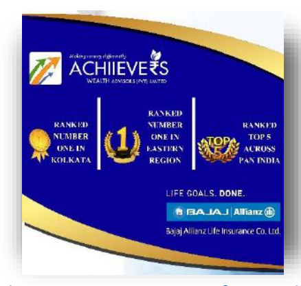
Achiievers, ADP Premier of Bajaj Allianz Achiievers Ranked No. 1 in Kolkata Achiievers Ranked No. 1 in Eastern Region Achiievers Ranked within top 5 across Pan India