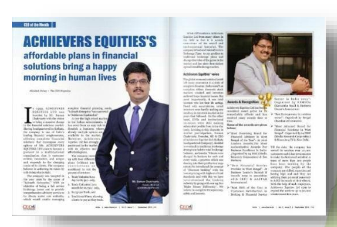
Awarded as the CEO of The Month 'The CEO Magazine' 2016