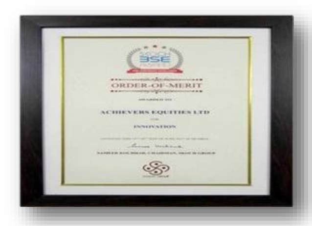
Order of Merit Year 2017