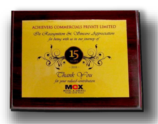
Awarded by Multi Commodity Exchange in 2018